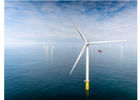
Indicative Offshore Wind Farm: Dudgeon, UK