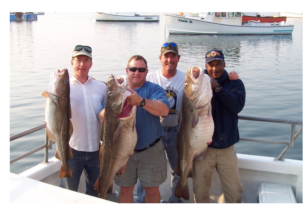
A successful recreational fishing trip aboard the Lady Tracey Ann, which sails from Eastman's Docks in Seabrook, NH. The large cod were caught in May 2007 on Jeffrey's Ledge in the Gulf of Maine.