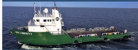
VESSEL: GO LIBERTY

Mobilization: April 19 Daylight operations Water Depths > ~7m Estimate Duration ~125 days LOA: 170' Call Sign: WDK6648 Phone: +1 337 735 1828 Monitoring VHF Channel 16