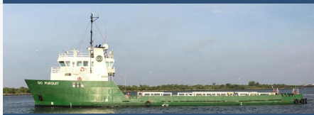
VESSEL: GO PURSUIT

Mobilization: April 17 24-hr operations Water Depths > ~12m Estimate Duration ~60 to 90 days LOA: 150' Call Sign: WDH 6498 Phone: +1 337 205 7400 Monitoring VHF Channel 16