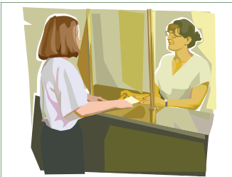
TDI REFUND EXAMPLE