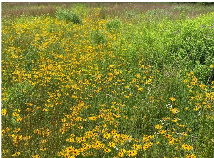
From burn to bloom: native pollinators and grassland habitat thrive at Pratt Farm following DEM's prescribed burns at this location.

Wildfires are expected to become more frequent in Southern New England due to climate change. DEM is responding by increasing the use of low-severity prescribed burns to reduce the build-up of combustible materials on forest floors and grasslands and by offering specialized wildfire training classes to build staff and volunteer capacity. In 2024, DEM treated 130 acres of state property with prescribed fire , nearly a threefold increase from 2023. In 2024, DEM conducted shaded fuel break brush clearing projects along various stretches of forestland on state lands to lessen the risk of uncontrolled wildfires. By increasing its use of prescribed fire, Rhode Island is better aligning its land management policies and practices with neighboring states. Among other benefits, common ecological restoration goals with other states help to strengthen climate change resilience across southern New England.