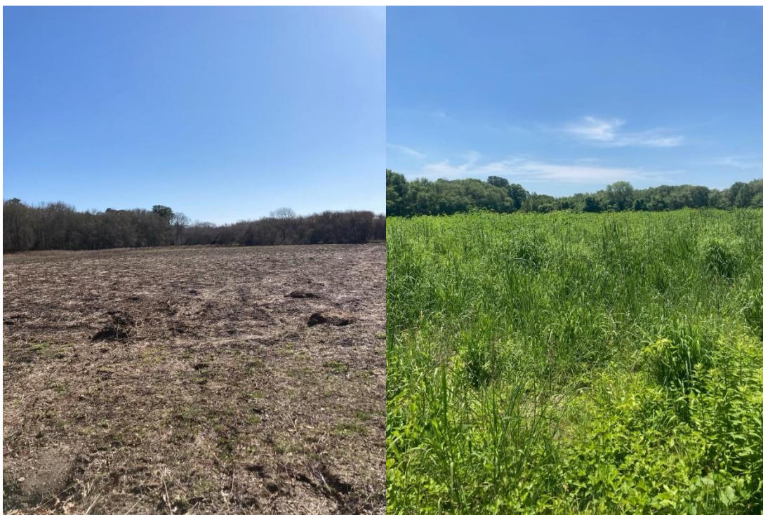
From burn to bloom: native pollinators and grassland habitat thrive at Great Neck Road field in Great Swamp Management Area following DEM's prescribed burns at this location.

DEM burn managers are targeting parcels at Durfee Hill Management Area in Glocester, Arcadia Management Area in Exeter, Nicholas Farm Management Area in Coventry, Big River Management Area in West Greenwich, Dutch Island in Jamestown, Carolina Management Area in Richmond, and Great Swamp Management Area in South Kingstown.